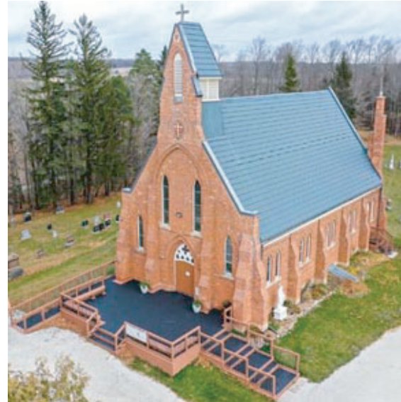
St. Cornelius, Silver Creek

OFFICE HOURS: Mon-Fri 9:00-5:00p.m.; Sat 1-6 p.m. & Sun 9-1:15 p.m.