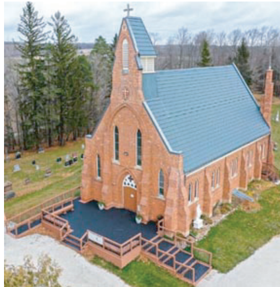
St. Cornelius, Silver Creek

OFFICE HOURS: Mon-Fri 9:00-5:00p.m.; Sat 1-6 p.m. & Sun 9-1:15 p.m.