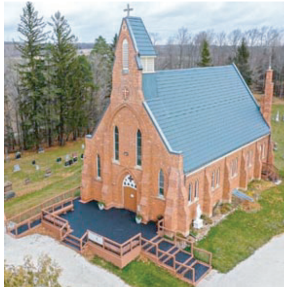
St. Cornelius, Silver Creek

16066 The Gore Road, Caledon, ON L7C 3E6