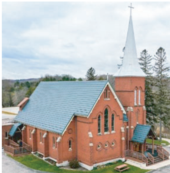
St. John's The Evangelist Church

websites: stjohntheevangelistca.archtoronto.org & stcorneliusca.archtoronto.org