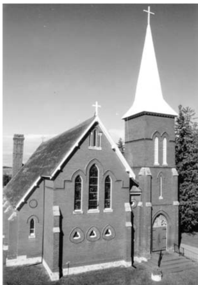
St. John's The Evangelist Church

websites: stjohntheevangelistca.archtoronto.org & stcorneliusca.archtoronto.org