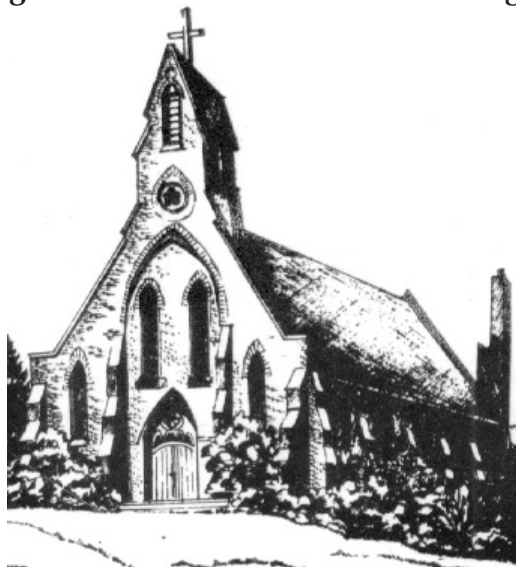
St. Cornelius, Silver Creek

16066 The Gore Road, Caledon, ON L7C 3E6