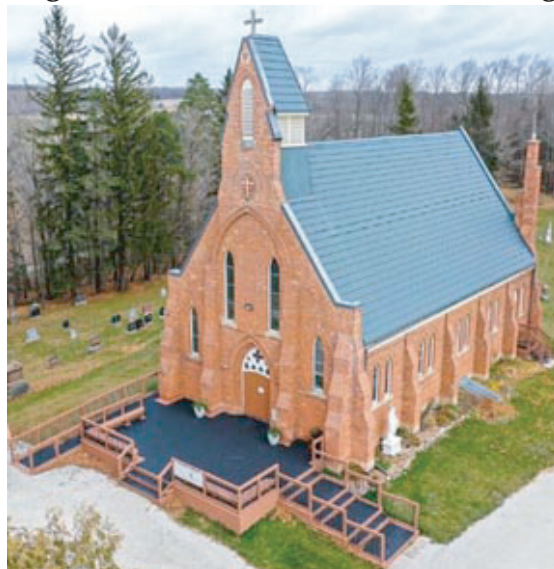
St. Cornelius, Silver Creek

OFFICE HOURS: Mon-Fri 9:00-5:00p.m.; Sat 1-6 p.m. & Sun 9-1:15 p.m.