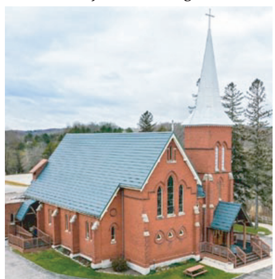
St. John's The Evangelist Church 16066 The Gore Road, Caledon, ON L7C 3E6

websites: stjohntheevangelistca.archtoronto.org & stcorneliusca.archtoronto.org