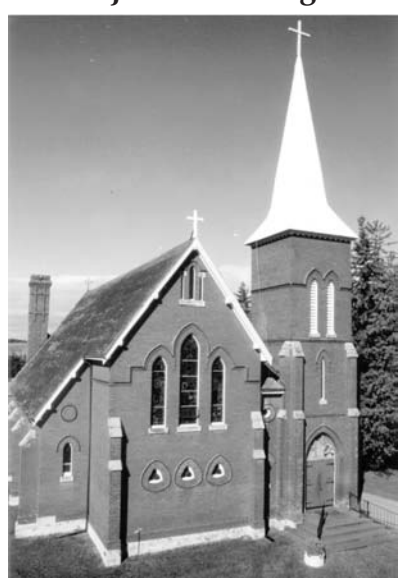
St. John's The Evangelist Church

websites: stjohntheevangelistca.archtoronto.org & stcorneliusca.archtoronto.org