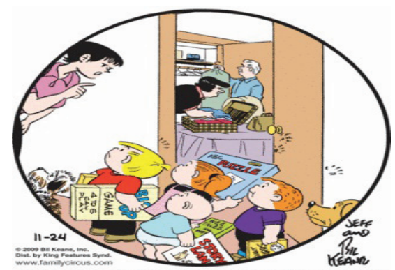
"Not now! Grandma and Granddad have to unpack and take a rest."

Please consider helping us to pay the bills during these troubling times. Drop off or mail your contributions to the parish office. By credit card please visit our parish website - Our Community - Donate. For Pre-authorized giving download an enrollment form from our parish website - Our Community - Donate. For Online banking e-mail campaign@archtoronto.org with Your name, Address, Parish name, Municipality. Thank you for your generosity!! If you have someone you would like me to pray for please email stjohnalbion@bellnet.ca